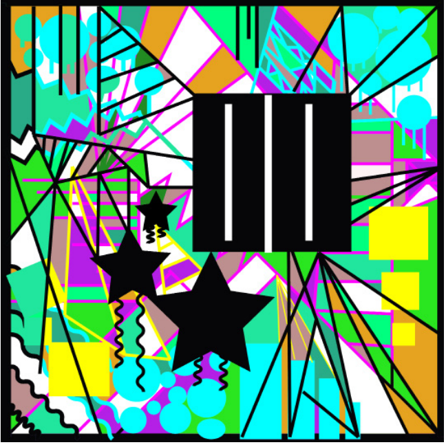
Choice of Color | Tim Ferrera

falling in love is like drinking poison straight from the bottle because you will feel it burn its way down your throat and spread through your veins like a wildfire you will never have felt so alive as it creeps to your heart and kills you